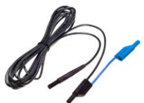
test lead 16.4 ft (5 m), black, 1 kV (banana plugs, shielded)