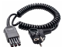
WS-04 adapter with UNI-SCHUKO angular plug