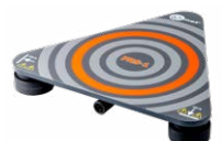
PRS-1 resistance test probe