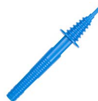
pin probe, blue 1 kV (banana socket)