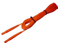
test lead 16.4 ft (5 m), red, 1 kV (banana plugs)