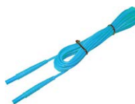
test lead 16.4 ft (5 m), blue, 1 kV (banana plugs)