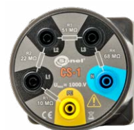
CS-1 cable simulator