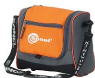
M-6 carrying case